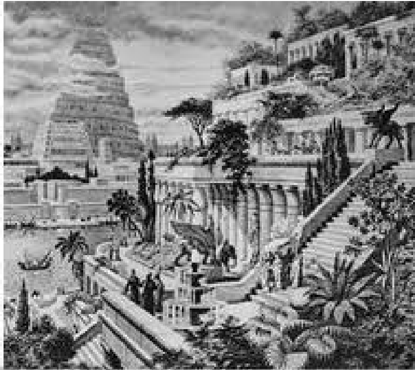
The Hanging Gardens of Babylon

Babylon the great: books are written on this great city, one of the 7 wonders of the Ancient World is the hanging gardens of Babylon.