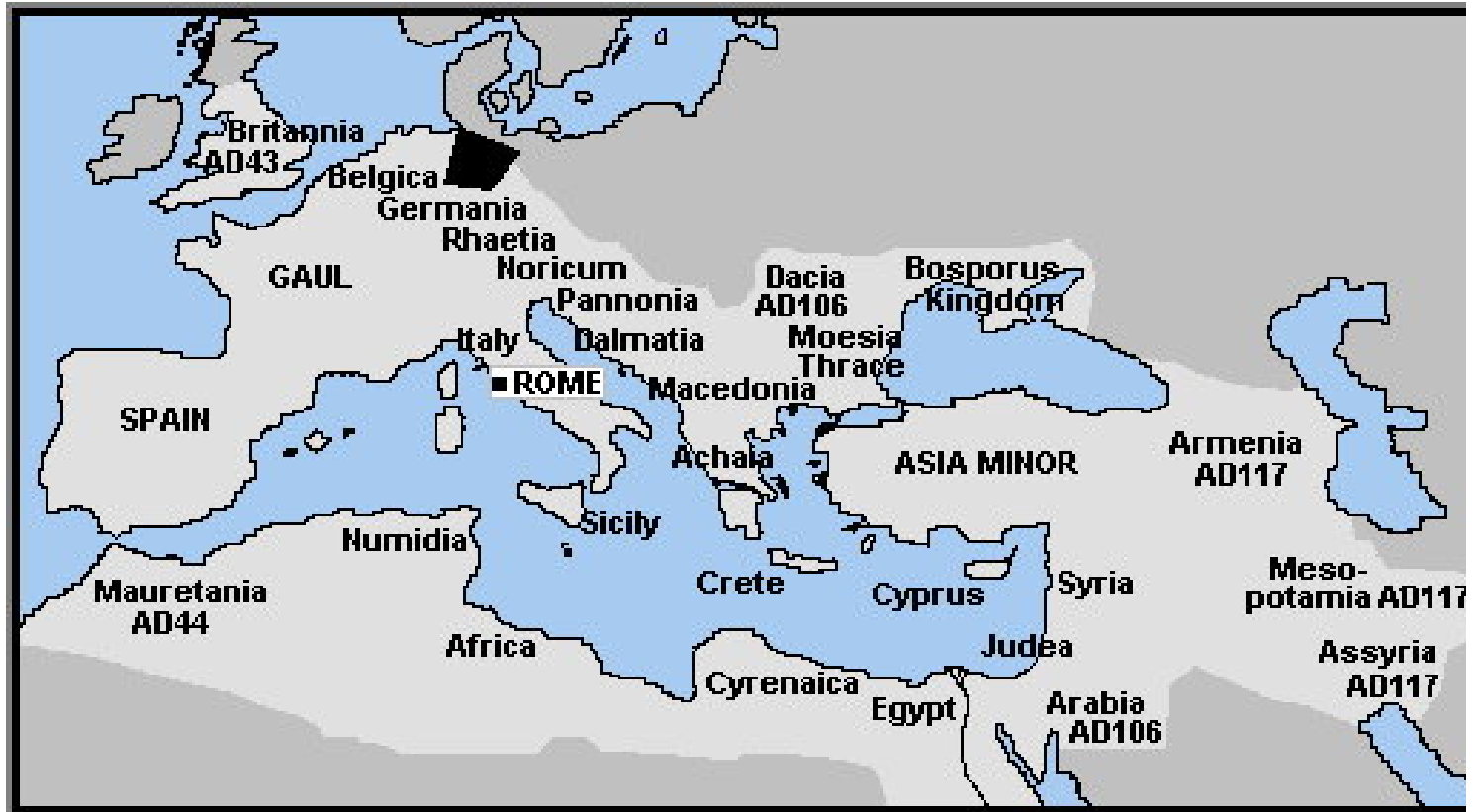
The Roman Empire

Eastern Mediterranean – two great powers: SYRIA and EGYPT ;