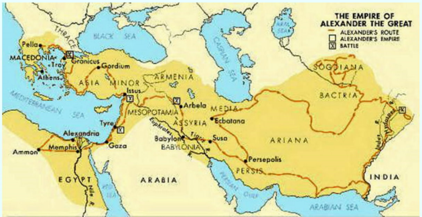
Alexander Greco-Macedonian Empire Map