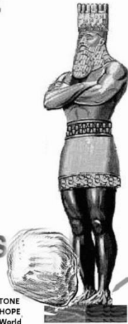
This STONE is the HOPE of the World