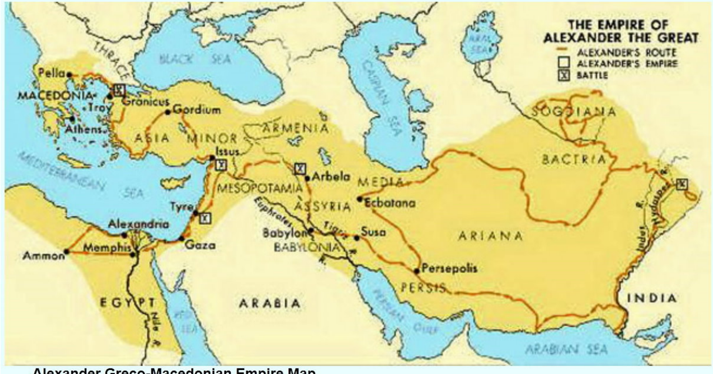
Alexander Greco-Macedonian Empire Map